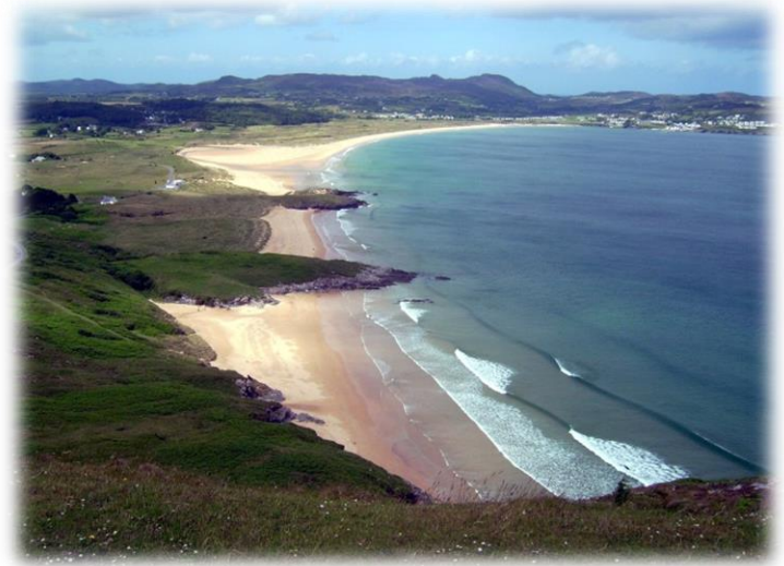
The beautiful Ballymastrocker Beach (10 min drive)